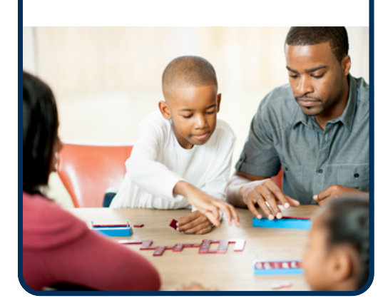
Wait and take turns