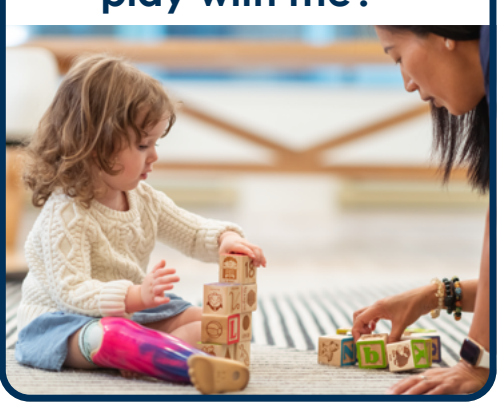
Say, "Will you play with me?"