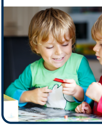
Use kind words