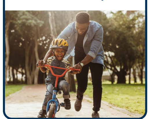
Ask for help