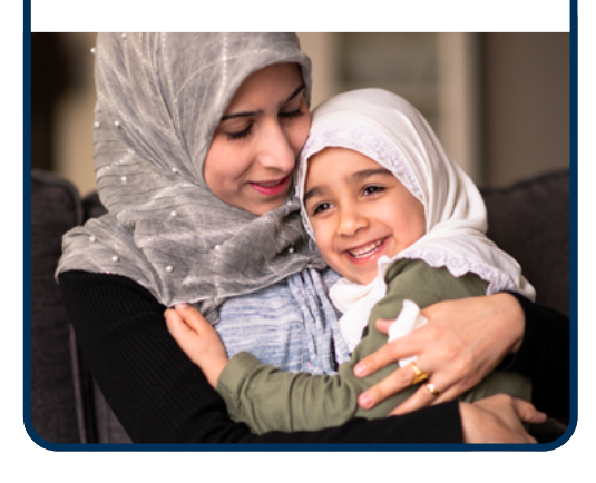
Ask for a hug