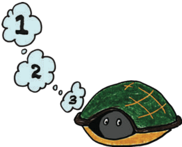
Step 3. Tuck inside your shell and take three deep breaths.