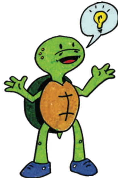
Step 4. Come out when you are calm and think of a solution.